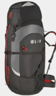
Lite rucksack 90 l