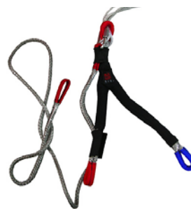
ULTRA-LIGHT TANDEM SPREADERS (DYNEEMA)