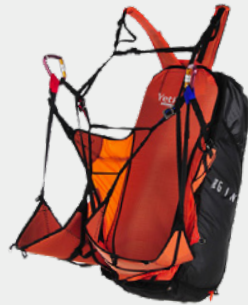
Yeti convertible 2 * 1.36 kg

* - not recommended for tandem use with rescue systems