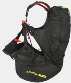
Safari pilot 2.6 kg