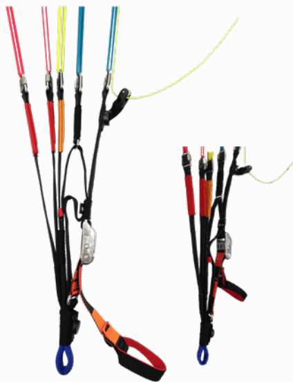
12MM KEVLAR RISERS