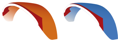
YETI TANDEM SIZE 41