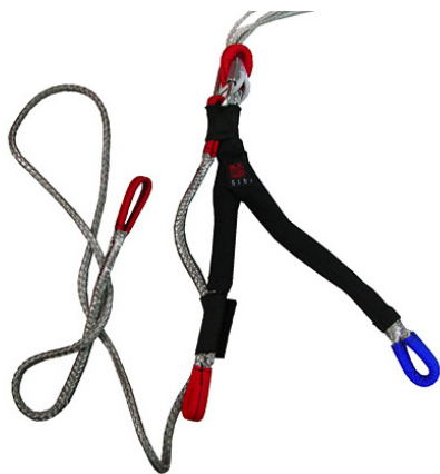
ULTRA-LIGHT TANDEM SPREADERS (DYNEEMA)

Ultralight Dyneema spreaders, Supple (soft) spreaders and Spreader bars (hard)