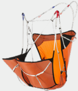
Yeti xtrem 2 * 295 g