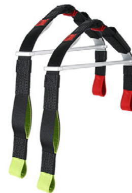
SPREADER BARS (HARD)