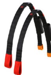
SUPPLE SPREADERS (SOFT)