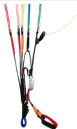
12MM KEVLAR RISERS