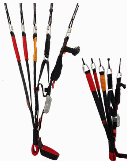
20MM WEBBING RISERS