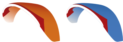
YETI TANDEM SIZE 37

Any option other than the serial delivery is available on request at additional cost.