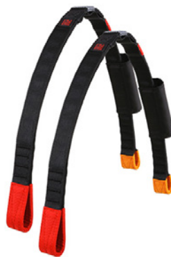
SUPPLE SPREADERS (SOFT)