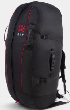
XXL rucksack 220 l