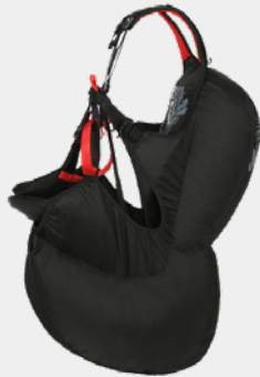
Safari passenger 1.7 kg

* - not recommended for tandem use with rescue systems